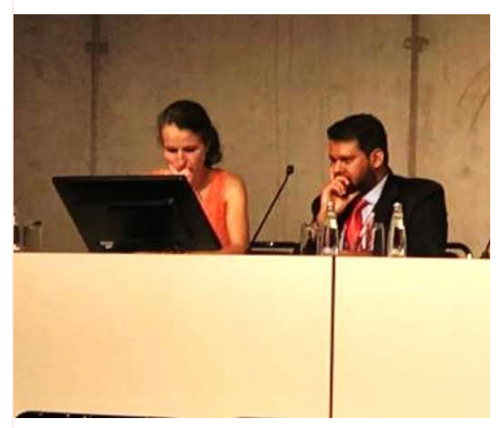
The privileged table